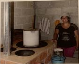
Saving lives by preventing lung disease with fuel efficient stoves.