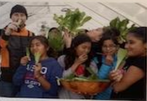
Promoting sustainable agriculture methods with aquaponics.