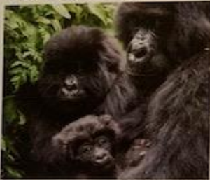
Protecting species threatened with extinction.