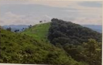
Conserving the world's most fragile forests.

Aquaponics provides a lot of solutions to the problems with modern agriculture, and it's something you can do anywhere! I want to share that with other people, because sustainability relies on education to spread."